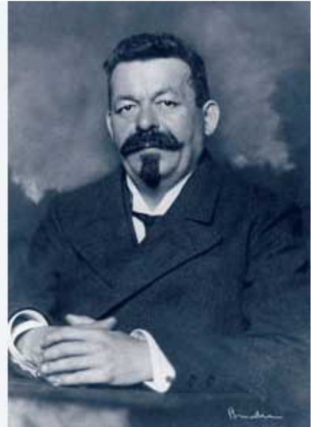
Portrait Friedrich Ebert, ca. 1918.